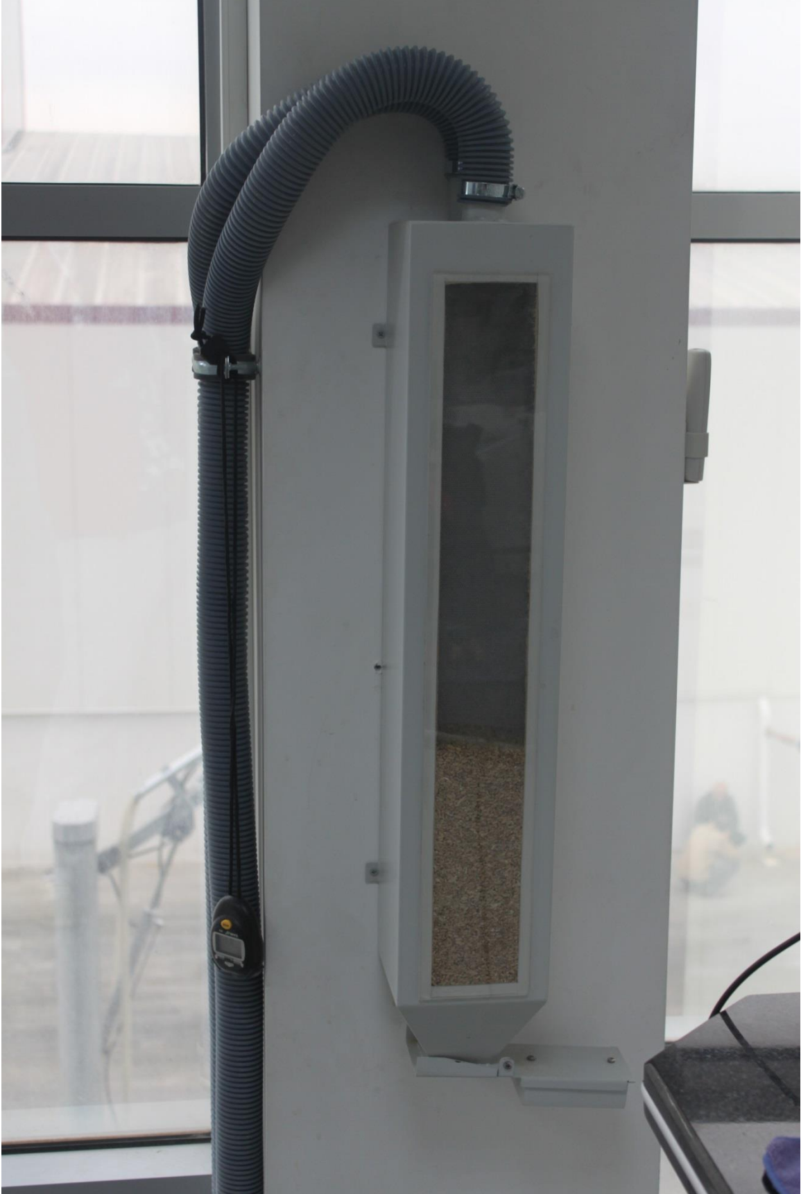
BASTAK ANALİTİK CİHAZLAR DIŞ TİCARET PAZARLAMA VE SANAYİ TİCARET LİMİTED ŞİRKETİ.